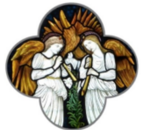
Easthampstead Parish Church