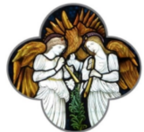
Easthampstead Parish Church

From 18th September, every Wednesday at 3-3:45pm at St Michael's Parish Centre (during the school term) we welcome any member of the Easthampstead community to donate, collect, share and reuse items so that all may thrive. We will have tables for children's coats & shoes, St Michael's uniforms, toys, books and long-life food items.