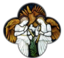
Easthampstead Parish Church

Every Wednesday 3-3:45pm in St Michael's Parish Centre (during the school term) we welcome any member of the Easthampstead community to donate, collect, share and reuse items so that all may thrive. Come and have a browse and refreshments.